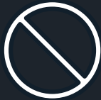
Trespassing & Intruders