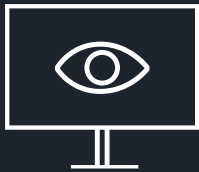
Video Monitoring and Review