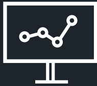
Professional IP Network Design