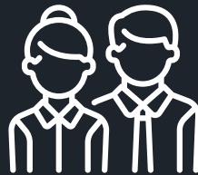
Comprehensive Employee Training

Stealth is a full-service advisor who will work with you to understand your business goals, security concerns, and property.