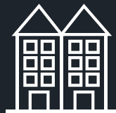
Manage Building Activity