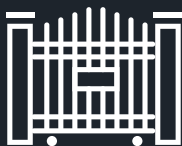
Gate Access Control